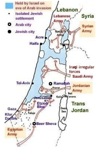
Figure 1 - Map of Israel's War of Independence - armishel.tistory.com/237

Other wars followed The War of Independence including: (1) The Six-Day War (1967), (2) The Yom Kippur War (1973), (3) The First Intifada (1987-93), (4) The Second Intifada (2000-05), and (5) The Gaza War (2008-09).