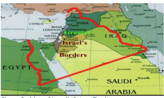
Figure 3 - Map of Israel's Future Territory www.biblerays.com

Where was Abraham when God made such promises? Was he in communication with God? Did he and God come to some agreement terms, such as, "If you do this, I will do that" ? Let's look at the timetable when God made this Covenant with Abraham. "As the sun was setting, Abram fell into a deep sleep, and a thick and dreadful darkness came over him" (Genesis 16:12). Abram was sound asleep and had no input into God's promises to him. Such a Covenant is called an "unconditional" covenant. In other words, Abraham did not have to do anything for God to give him this promise of a land. The fulfillment of God's promise was based upon God's faithfulness and not Abraham's goodness or faithfulness. God made the