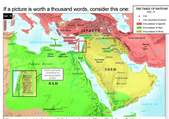
Figure 1 - Holman Bible Atlas — The Table of Nations

LANGUAGE: Besides a common ancestor for their blood and DNA, both Jews and Arabs speak a "Semitic Language." What do we mean by that statement? If we go back to Noah's three sons, we discover where each son went. Japheth moved to the north area (Europe), Ham to the south (Africa), and Shem to the east and south-east (Asia & Arabia). Without getting lost in the weeds, the Semitic languages can trace back to one of the sons of Noah by the name of Shem. From the name Shem comes the word "Shemites" or "Semites." Three of the Semitic languages in the Middle East are Arabic, Hebrew, and Aramaic, and the Old