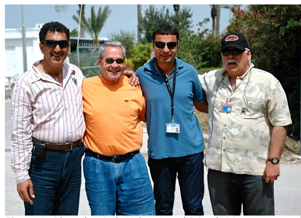
Figure 4 - Israel Friends Meet

Though Arab and Jew may be related, distrust and hostility continue to prevail. And without a change in the heart, there will be no peace. But as you've seen