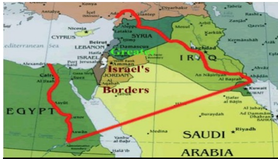
Figure 3 - Map of Israel's Future Territory - www.biblerays.com

In the Book of Numbers, Moses tells His people the future boundaries of Israel (southern, western, northern, and eastern boundaries (Numbers 34:3-12). And (Ezekiel 47:15-20) provides the borders of Israel's future land once again. Israel's neighbors are doing all they can to reduce the Jewish territory, but God will determine who receives what portion of the property. After all, the Land is God's Land, and He will give to whomever He wants to give it – “The earth is the LORD’s, and everything in it, the world, and all who live in it” (Psalm 24:1). And since the Abrahamic Covenant is an “eternal” Covenant, the promise and contracts are guaranteed.