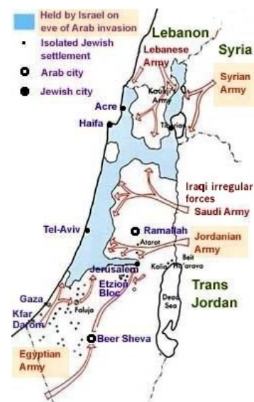
Figure 1 - Map of Israel's War of Independence

Later, God enlarged the covenant to include more specific information. God told Abraham, "Lift up your eyes from where you are and look north and south, east and west. All the land that you see I will give to you and your offspring forever." (Genesis 13:14). We don't know exactly where Abraham was standing, but it was at a high enough elevation to see the whole plain of the Jordan Valley, which would have been east from where he was standing. As Abraham turned around to the south and west and north, his