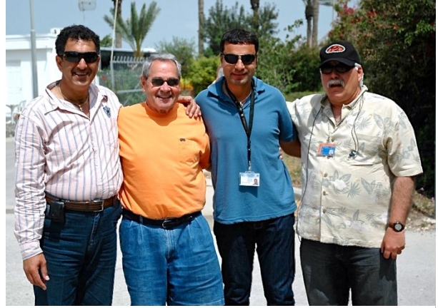
Figure 4 - - Israel Friends Meet

Though Arab and Jew may be related, distrust and hostility continue to prevail. And without a change in the heart, there will be no peace. But as you've seen in the above photograph, God's redemption for the four men in the photo produces God's love for each other. Only through Christ, can Jews and Arabs live more like Kissing Cousins and less like the Hatfields and McCoys.